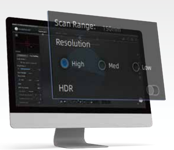
High Resolution Low Resolution