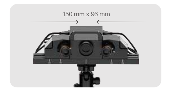
Inner Smaller Field of View for scanning small objects

The slide-rail design enables an easy switch of the scanning range between 150 mm x 96 mm and 300 mm x 190 mm meeting the needs of scanning objects of different sizes effectively.